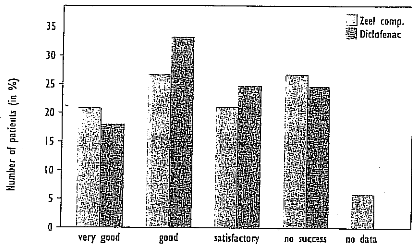
Fig. 2: Overall assessment (opinion of patients) of the efficacy of the treatment after 10 weeks.

groups in more than 85% of the cases as "very good" or "good".